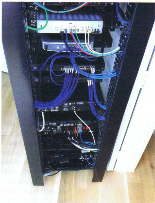
The original wireless network was insufficient, so Eco High Fidelity in Richardson, Texas, used Pakedge equipment to create VLANs to support Crestron and Kaleidescape.